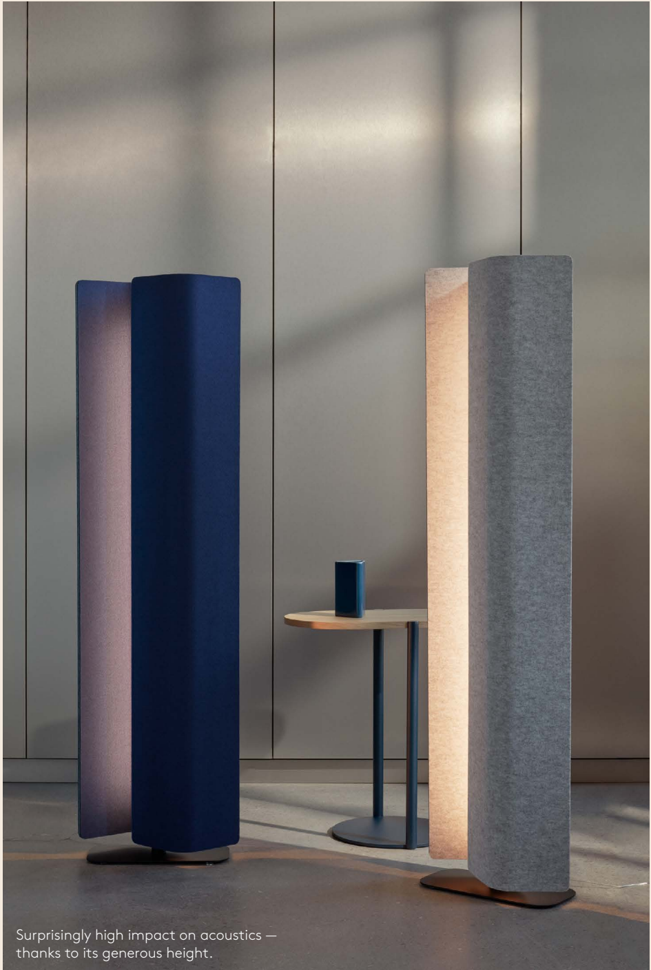
Surprisingly high impact on acoustics — thanks to its generous height.